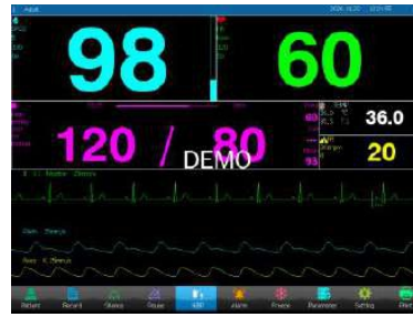
Large Font Interface