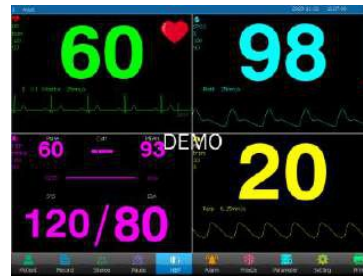
Quad Split Screen Interface